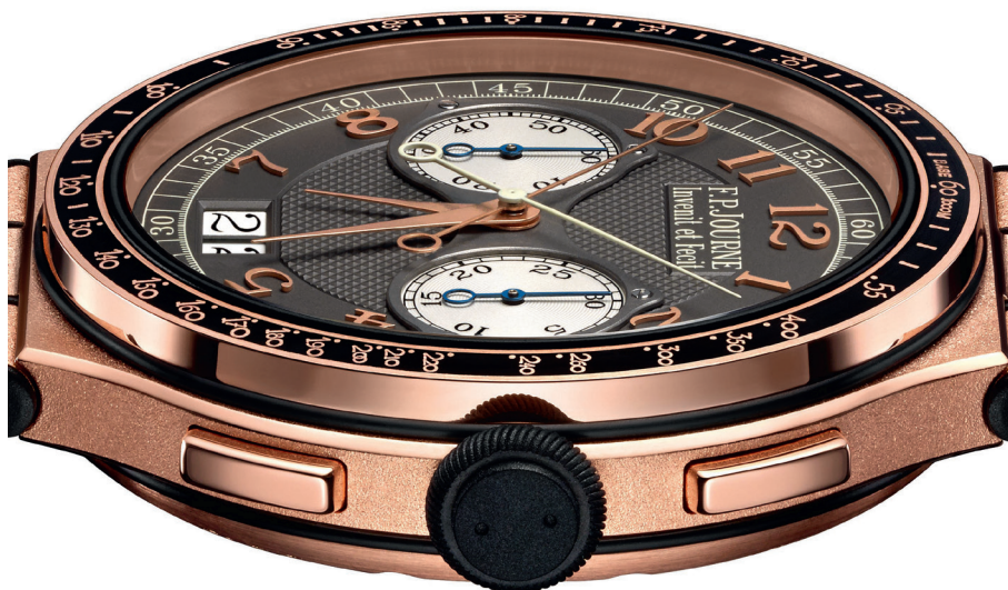
SPORTS WATCH F.P. Journe Chronographe Monopoussoir Rattrapante

The latest entry in F.P. Journe's Line-Sport collection, the Chronographe Monopoussoir Rattrapante emphasizes elegant design with the addition of a multilevel dial, a scaled bezel, and case options in red gold, platinum, and titanium. The strongest feature is the rattrapante chronograph movement, modified from the one-of-a-kind piece that the brand's founder and head watchmaker, François-Paul Journe, produced for 2017's Only Watch auction. Rather than putting his idiosyncratic twist on the complication's function, Journe seems to have preferred emulating some of the fondly remembered chronograph movements of the past in the looping levers and flowing bridges seen on this caliber. (from $61,100) fpjourne.com -J.D.M.