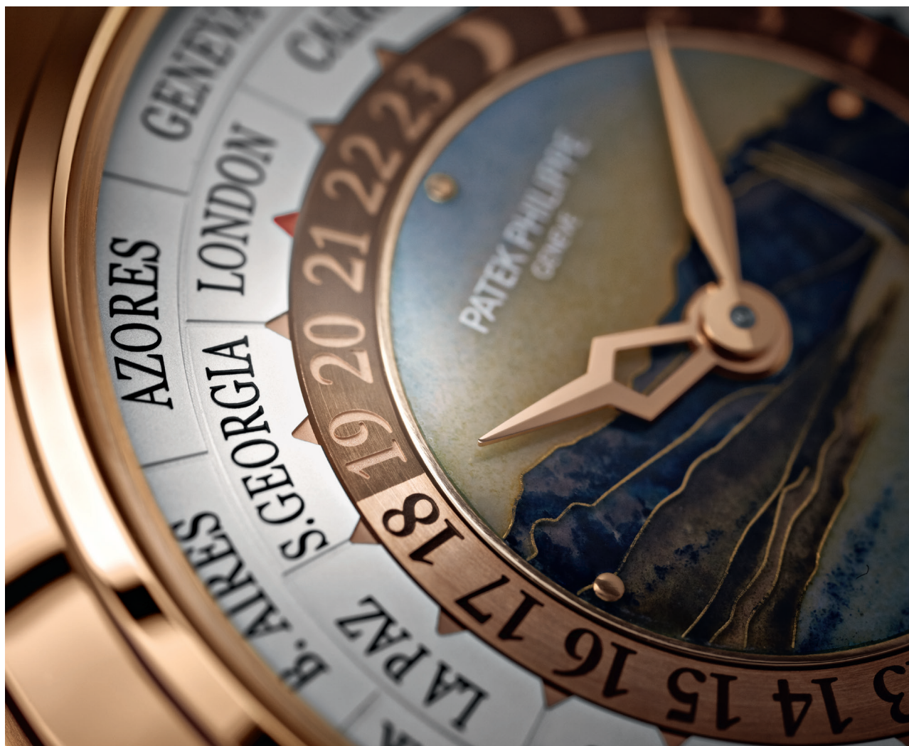
ILLUSTRATION BY PADDY MILLS; PATEK PHILIPPE: JEAN-DANIEL MEYER

Stern's unveiling of the Calibre 89 at the company's 150th anniversary in 1989 was the public's first glimpse of that vision. The most complicated mechanical watch in the world at the time, it represented a codification of venerable watchmaking techniques that would increasingly be gathered under the company's roof and executed with modern, computer-assisted manufacturing techniques. A growing body of collectors—wowed by spectacular auctions and Stern's subtle promotion of exotic complicated and artisanally decorated watches—fed a voracious demand for the company's pieces that has continued as steadily as any of its movements. A steady drumbeat of innovative models, as well as new facilities and capacities, means that as much as other companies emulate Patek Philippe, they still struggle to keep up. patek.com -J.D.M.