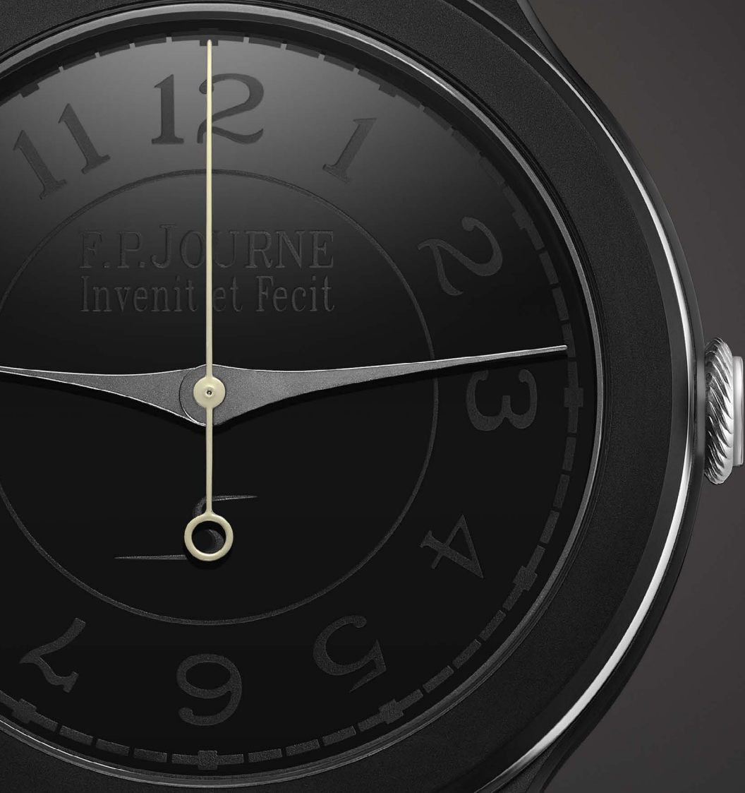
CHRONOMÈTRE FURTIF REF. CF