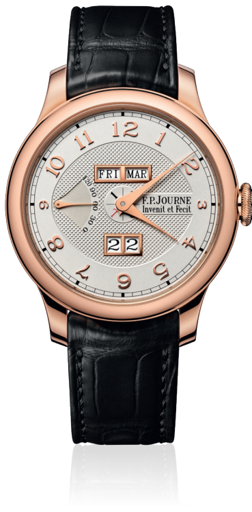
Quantième Perpétuel Ref. QP