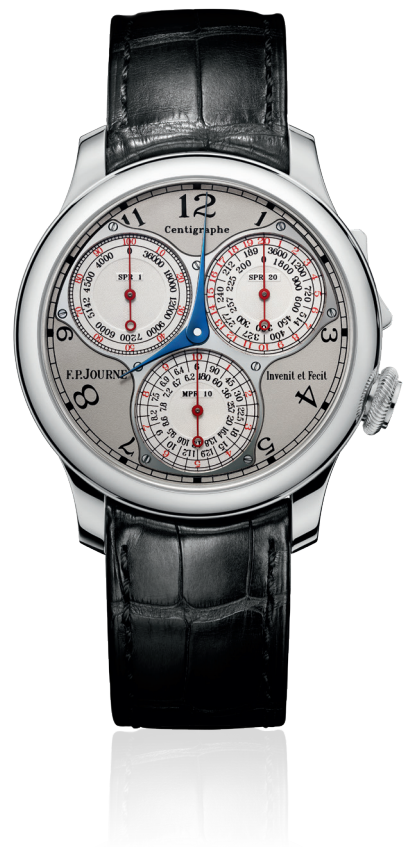
Centigraphe Souverain Ref. CT