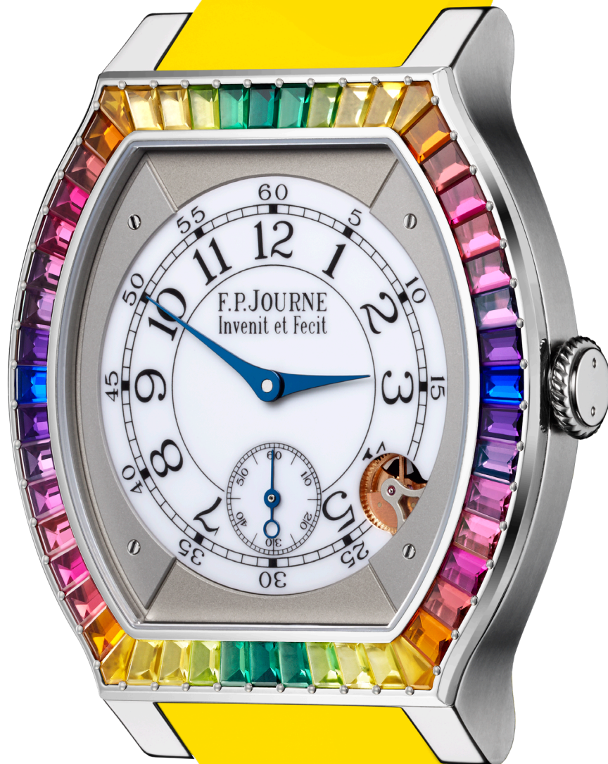
élégante Gino's Dream Ref. ELHT

A revolutionary concept: the electromechanical caliber 1210 ensures an extremely long autonomy of 8 to 10 years in daily use, which can reach up to 18 years in standby mode. After 35 minutes of inactivity, the watch goes into sleep mode to conserve energy. When it is put back on the wrist, the hands automatically reset to the exact time by the shortest path. The élégante is available with a Flat Tortue® case in two sizes, 40 and 48 mm, on a wide range of rubber or semi-set bracelets.