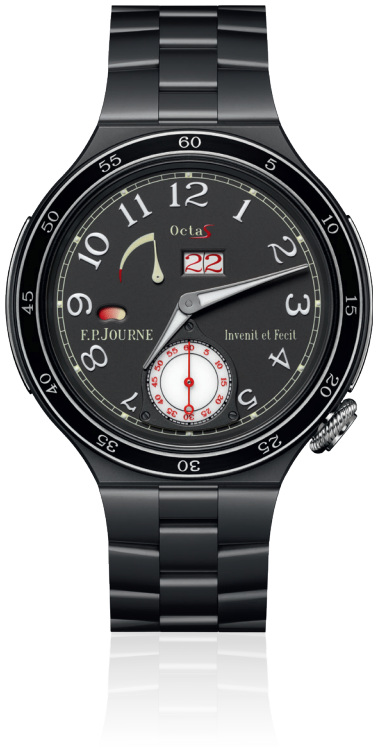
Automatique Réserve Ref. ARS2