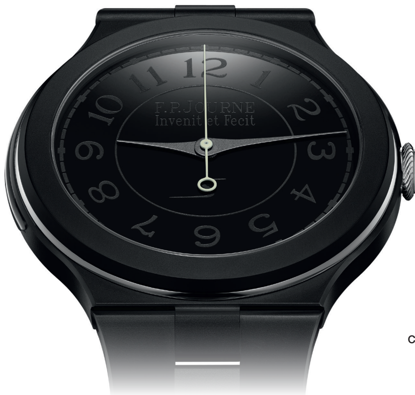
Chronomètre Furtif Ref. CF

The lineSport collection offers watches with a contemporary sporty character, incorporating high-end horological complications. The Automatique Réserve, the Centigraphe and the Chronographe Rattrapante are available in an ultra-light version with a Titanium case and bracelet paired with an Aluminum movement. They are also offered in Platinum and 18K 6N Gold, with matching metal bracelets and an 18K rose Gold movement. A recent addition to the collection, the Chronomètre Furtif introduces a case and bracelet in Tungsten Carbide, a material used for the first time by F.P. Journe, exclusively paired with an 18K rose Gold movement.