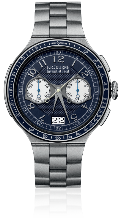
Chronographe Rattrapante Ref. CM

The lineSport collection offers watches with a contemporary sporty character, incorporating high-end horological complications. The Automatique Réserve, the Centigraphe and the Chronographe Rattrapante are available in an ultra-light version with a Titanium case and bracelet paired with an Aluminum movement. They are also offered in Platinum and 18K 6N Gold, with matching metal bracelets and an 18K rose Gold movement. A recent addition to the collection, the Chronomètre Furtif introduces a case and bracelet in Tungsten Carbide, a material used for the first time by F.P. Journe, exclusively paired with an 18K rose Gold movement.