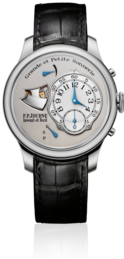
Sonnerie Souveraine Ref. GS