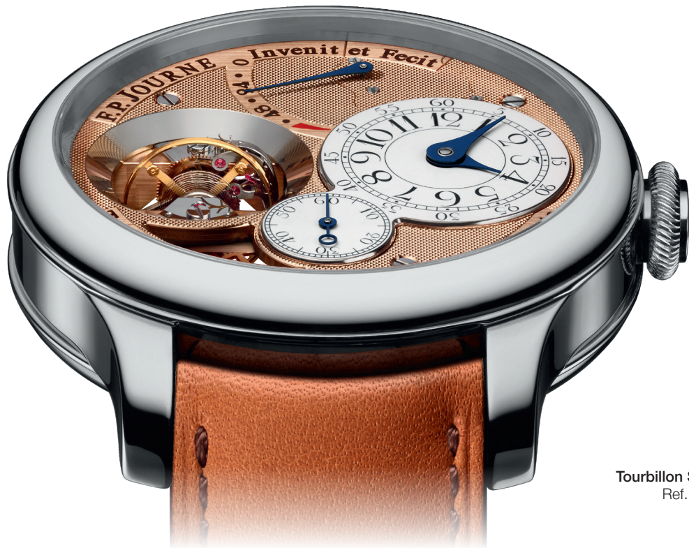
Tourbillon Souverain Ref. TV

The precision chronometers of the Classique Collection are the result of horological challenges taken beyond established limits. All the exclusive mechanical calibers in 18K rose Gold are entirely designed and manufactured in-house. Each model, whether equipped with a manual winding movement or the automatic Octa caliber, reflects the philosophy of F.P. Journe: to innovate while respecting tradition.