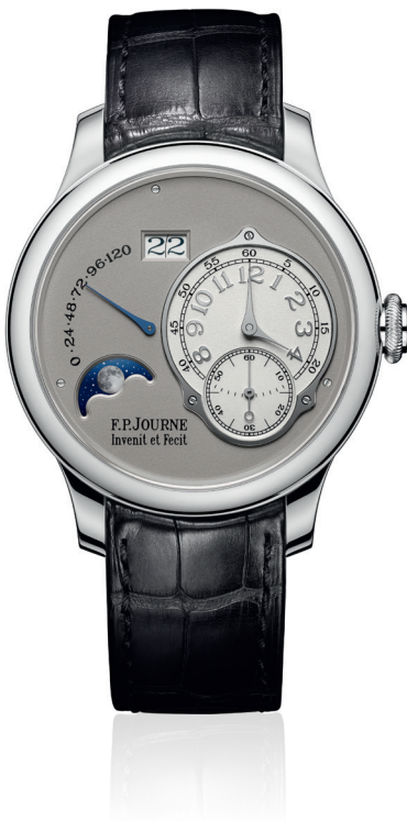
Lune Ref. LN

The precision chronometers of the Classique Collection are the result of horological challenges taken beyond established limits. All the exclusive mechanical calibers in 18K rose Gold are entirely designed and manufactured in-house. Each model, whether equipped with a manual winding movement or the automatic Octa caliber, reflects the philosophy of F.P. Journe: to innovate while respecting tradition.