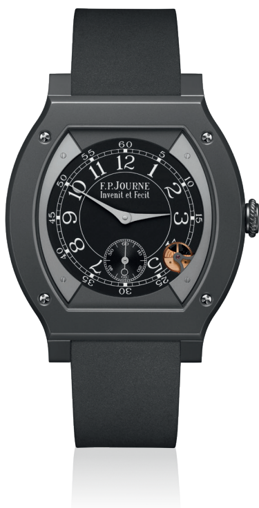
élégante Ref. ELHT