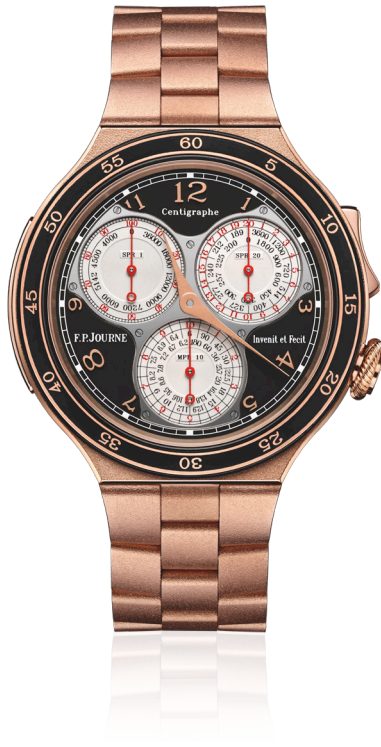
Centigraphe Ref. CT2