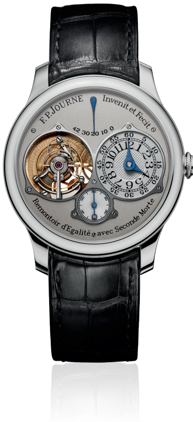
Tourbillon Souverain Ref. TN