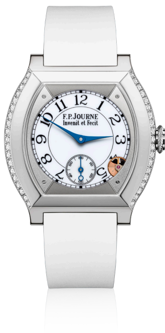
élégante Ref. ELT