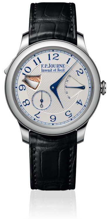
Répétition Souveraine Ref. RM