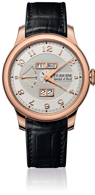
Quantième Perpétuel Ref. QP