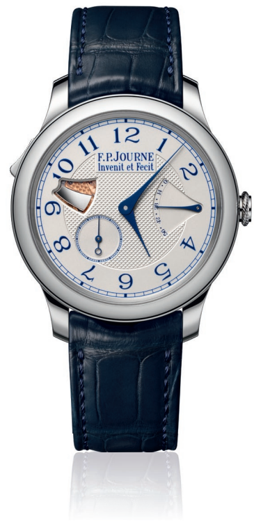
Répétition Souveraine Ref. RM