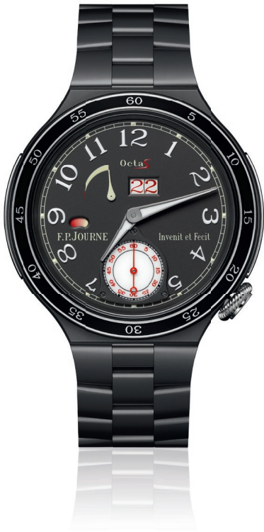
Automatique Réserve Ref. ARS2