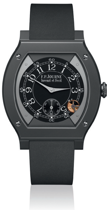
élégante Ref. ELHT