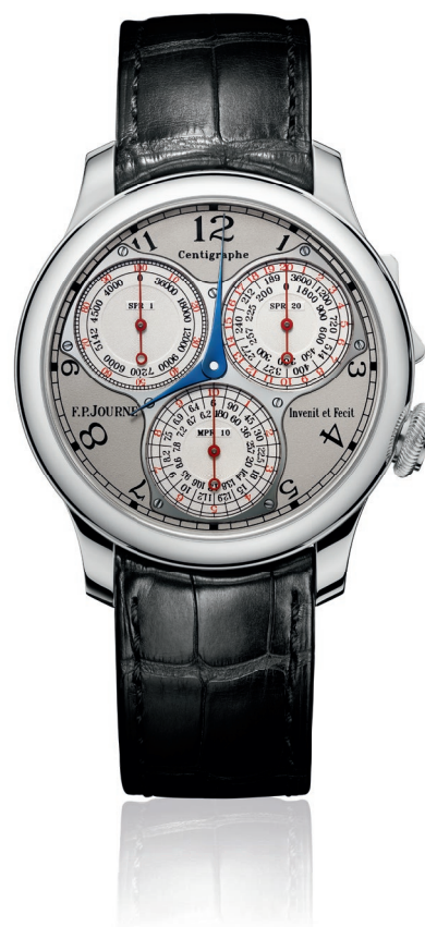
Centigraphe Souverain Ref. CT