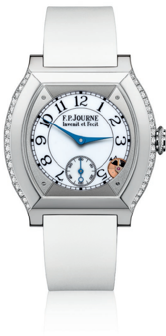
élégante Ref. ELT