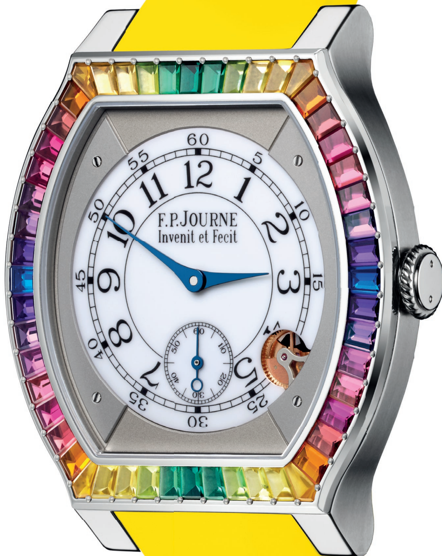
élégante Gino's Dream Ref. ELHT

A revolutionary concept: the electromechanical caliber 1210 ensures an extremely long autonomy of 8 to 10 years in daily use, which can reach up to 18 years in standby mode. After 35 minutes of inactivity, the watch goes into sleep mode to conserve energy. When it is put back on the wrist, the hands automatically reset to the exact time by the shortest path. The élégante is available with a Flat Tortue® case in two sizes, 40 and 48 mm, on a wide range of rubber or semi-set bracelets.