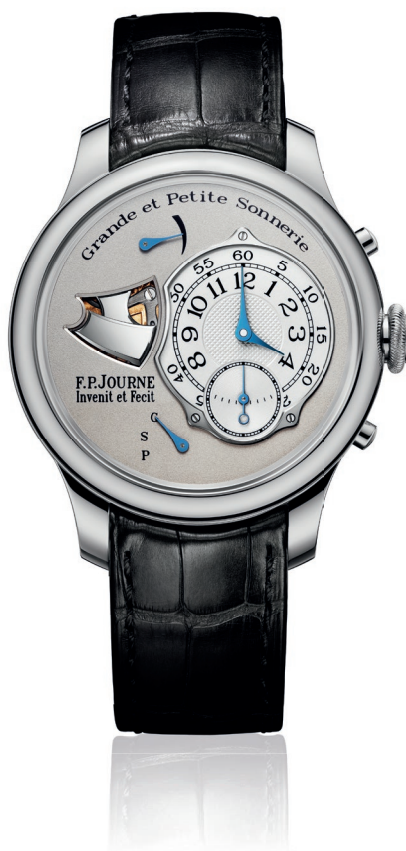
Sonnerie Souveraine Ref. GS