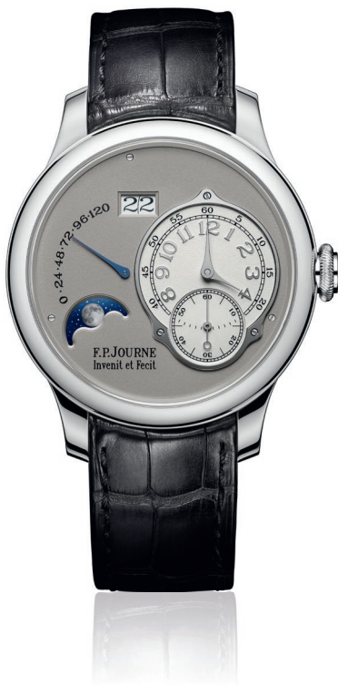
Lune Ref. LN

The precision chronometers of the Classique Collection are the result of horological challenges taken beyond established limits. All the exclusive mechanical calibers in 18K rose Gold are entirely designed and manufactured in-house. Each model, whether equipped with a manual winding movement or the automatic Octa caliber, reflects the philosophy of F.P. Journe: to innovate while respecting tradition.