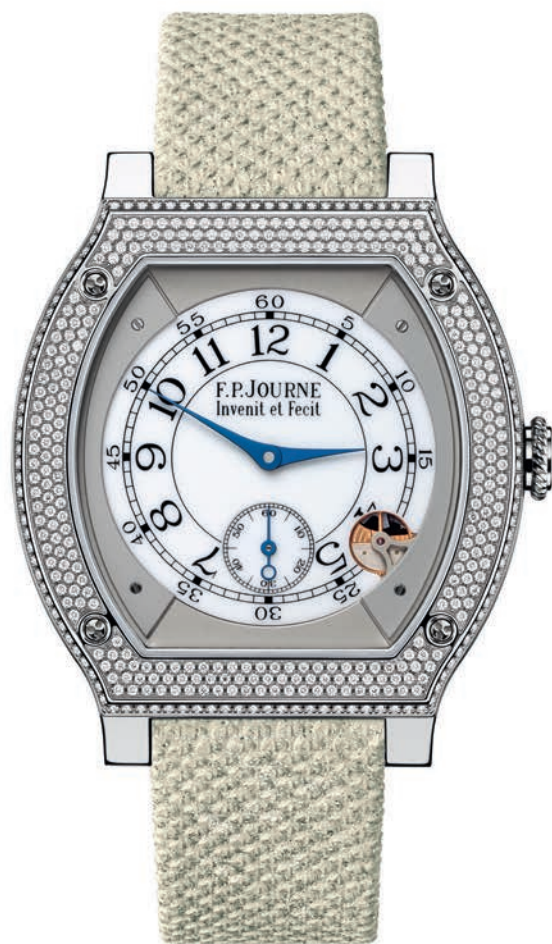
élégante_ Ref. ELHT Calibre 1210

Indications: central hours and minutes, small seconds. Case: flat Tortue®, 48 x 40 mm in polished and brushed Titanium with screwed bezel set with 418 brilliant cut diamonds VVS F/G ~ 1.06 carats Dial: centre in entirely luminescent sapphire, outer dial with screwed Steel elements. Hands: blued Steel. Strap: Karung snake silver white.