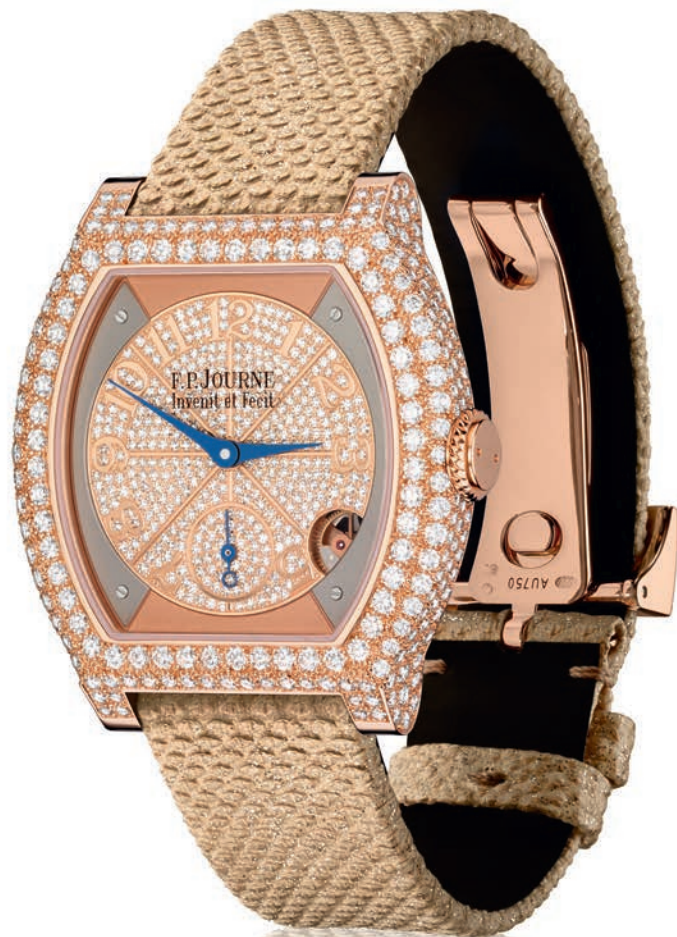
élégante_ Ref. EL Calibre 1210

Indications: central hours and minutes, small seconds. Case: flat Tortue®, 40 x 35 mm in Platinum or in 18K red Gold, set with 281 brilliant cut diamonds VVS F/G ~ 3.23 carats, overall height 7.35 mm. Dial: centre set with 381 brilliant cut diamonds VVS F/G ~ 0.6 carat, outer with screwed Steel elements. Hands: blued Steel. Strap: Karung snake silver white or rose.