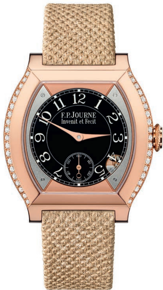
élégante_ Ref. EL Calibre 1210

Indications: central hours and minutes, small seconds. Case: flat Tortue®, 40 x 35 mm in 18K red Gold, set with 38 brilliant cut diamonds VVS F/G ~ 0.50 carat, overall height 7.35 mm. Dial: centre in black sapphire, outer with screwed Steel elements. Hands: 5N gilt Steel. Strap: Karung snake silver rose.