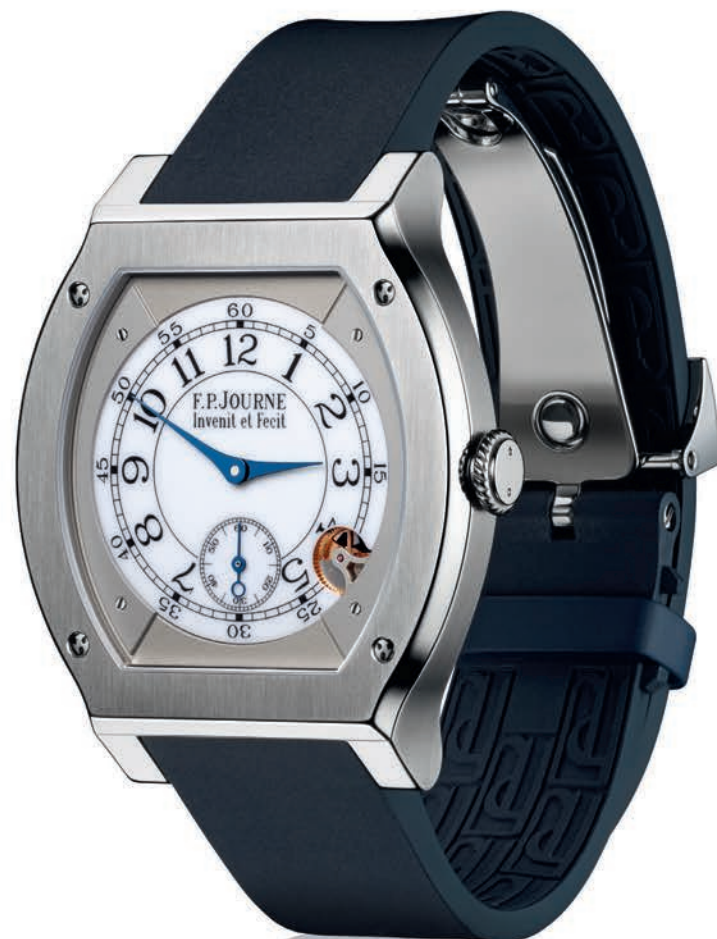
élégante_ Ref. ELHT Calibre 1210

Indications: central hours and minutes, small seconds. Case: flat Tortue®, 48 x 40 mm in polished and brushed Titanium with screwed bezel. Dial: centre in entirely luminescent sapphire, outer dial with screwed Steel elements. Hands: blued Steel. Strap: Rubber navy blue.