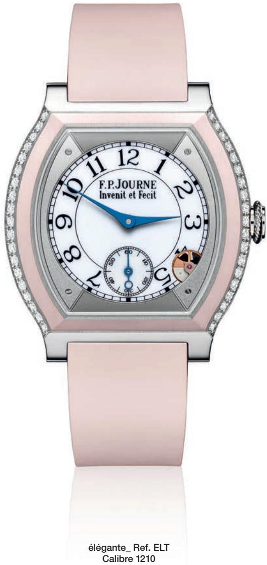
élégante_ Ref. ELT Calibre 1210

Indications: central hours and minutes, small seconds. Case: flat Tortue®, 40 x 35 mm In Titanium with cloisonné inserts, set with 38 brilliant cut diamonds VVS F/G ~ 0.50 carat, overhall height 7.35 mm. Dial: centre in entirely luminescent sapphire, outer dial with screwed Steel elements. Hands: Blued Steel. Strap: Rubber powder rose.