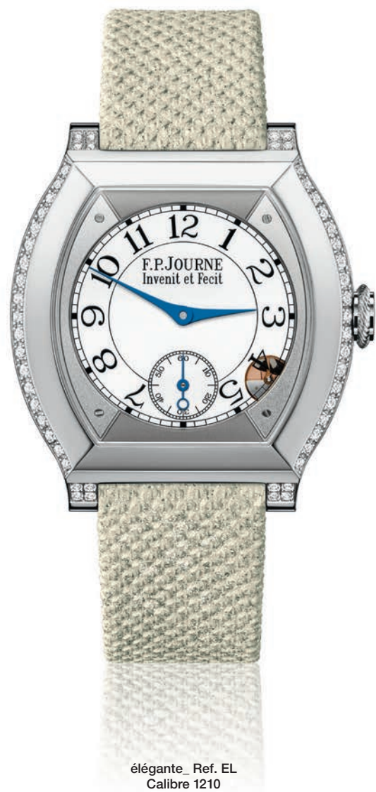
élégante_ Ref. EL Calibre 1210

Indications: central hours and minutes, small seconds. Case: flat Tortue®, 40 x 35 mm in Platinum, set with 54 brilliant cut diamonds VVS F/G ~ 0.62 carat, overall height 7.35 mm. Dial: centre in white sapphire, outer with screwed Steel elements. Hands: blue Steel. Strap: Karung snake silver white.