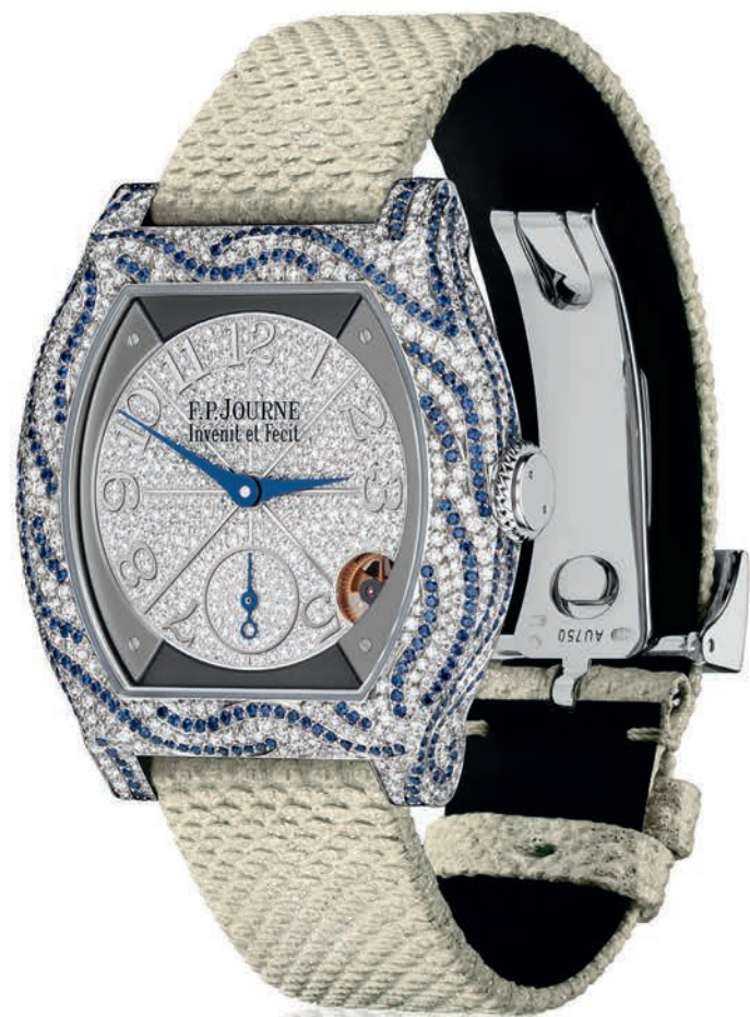
élégante_ Ref. EL Calibre 1210

Indications: central hours and minutes, small seconds. Case: flat Tortue®, 40 x 35 mm in Platinum, Artistic set with 787 brilliant cut diamonds VVS F/G ~ 1.05 carats and blue sapphire ~ 1.09 carats, overall height 7.35 mm. Dial: centre set with 381 brilliant cut diamonds VVS F/G ~ 0.6 carat, outer with screwed Steel elements. Hands: blued Steel. Strap: Karung snake silver white.